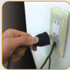
Insert the plug into the outlet. (100V)