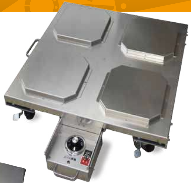
※The insulation cover is sold separately.