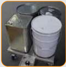
Place pail cans or five gallon cans on the heater (Up to four cans)

Pull out the temperature controller located on the side of the heater.