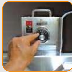
Turn the dial to adjust the temperature (Up to 110°C/°F)